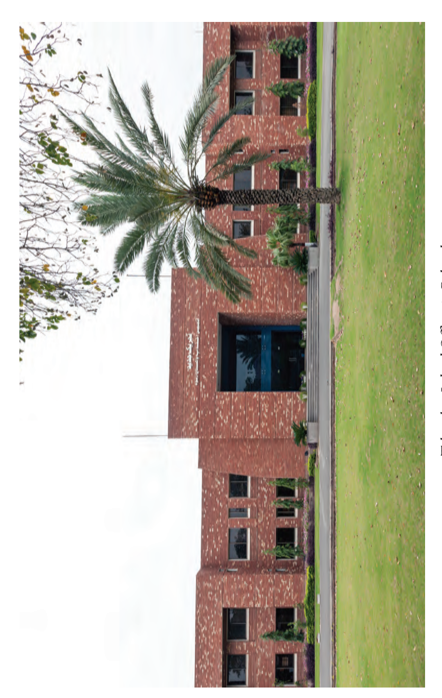
Tahreek-e-Jadeed Offices in Rabwah