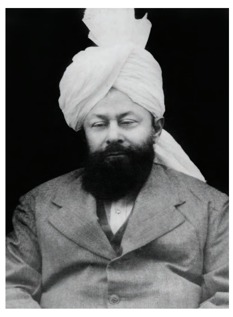
Hazrat Mirza Bashir-ud-Din Mahmud Ahmad Khalifatul-Masih II<sup>ra</sup>