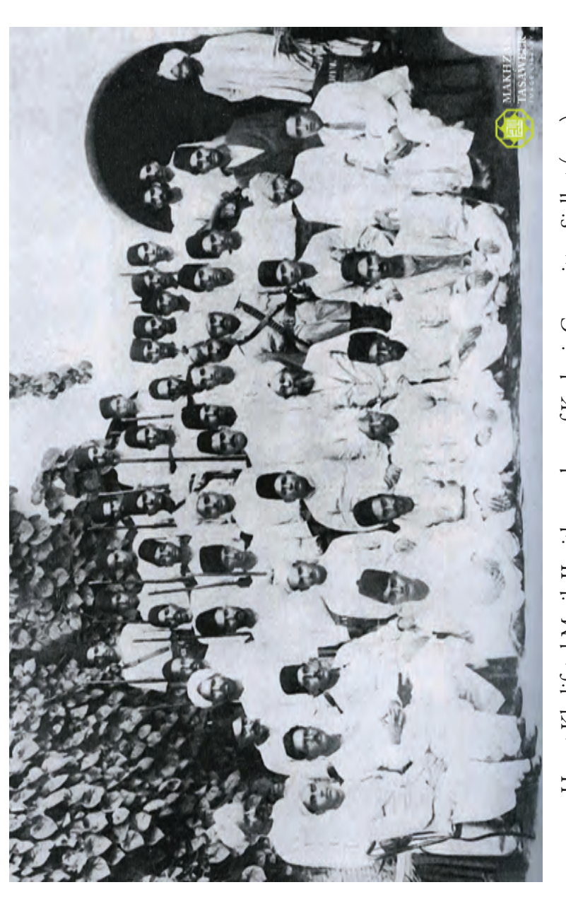
Hazrat Khalifatul-Masih II with members of Kashmir Committee Sialkot (1931)