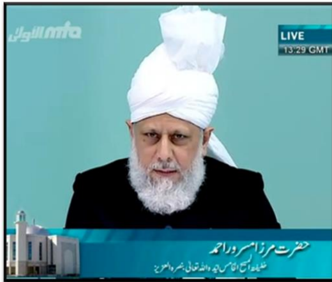
Sermon Delivered by Hadhrat Mirza Masroor Ahmad (aba); Head of the Ahmadiyya Muslim Community