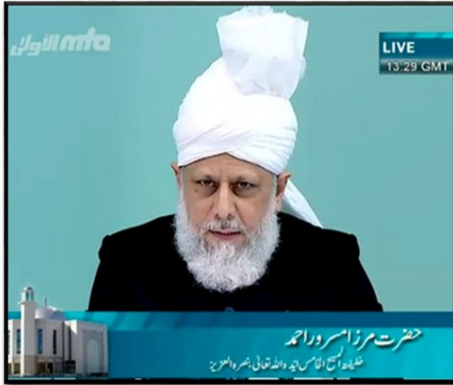
Sermon Delivered by Hadhrat Mirza Masroor Ahmad (aba); Head of the Ahmadiyya Muslim Community