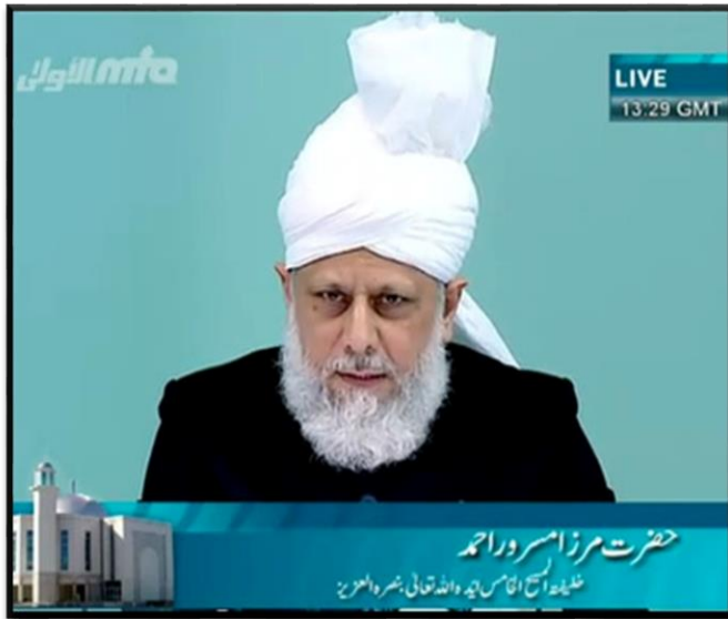
Sermon Delivered by Hadhrat Mirza Masroor Ahmad (aba); Head of the Ahmadiyya Muslim Community