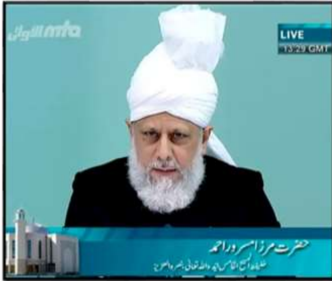
Sermon Delivered by Hadhrat Mirza Masroor Ahmad (aba); Head of the Ahmadiyya Muslim Community