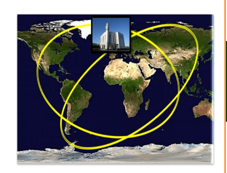
relayed live all across the globe