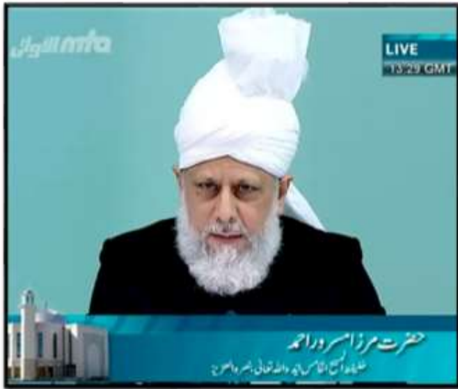
Sermon Delivered by Hadhrat Mirza Masroor Ahmad (aba); Head of the Ahmadiyya Muslim Community