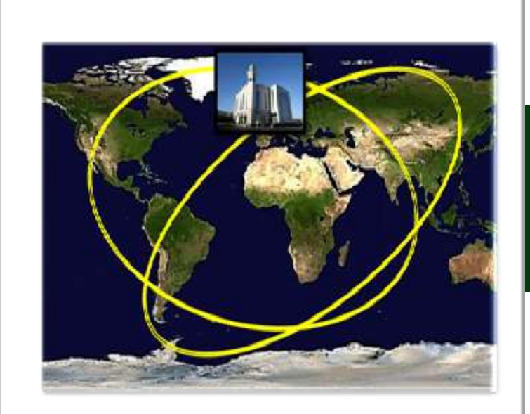
relayed live all across the globe