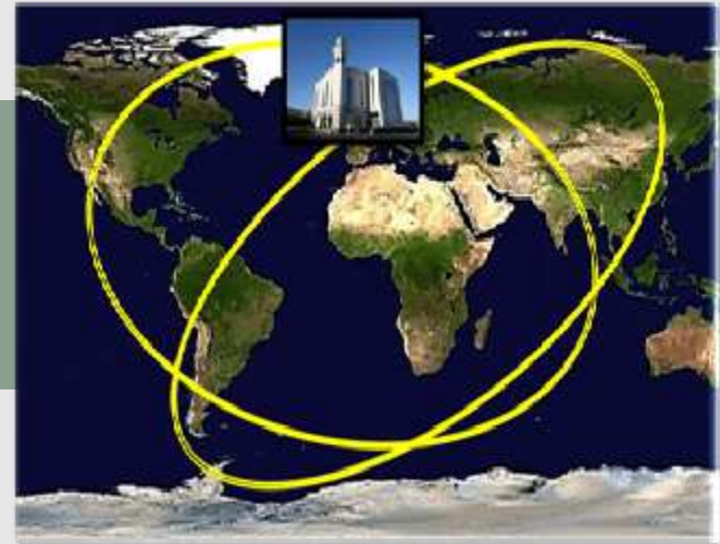
RELAYED LIVE ALL ACROSS THE GLOBE