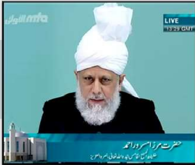
SERMON DELIVERED BY HADHRAT MIRZA MASROOR AHMAD (ABA); HEAD OF THE AHMADIYĀ MUSLIM COMMUNITY